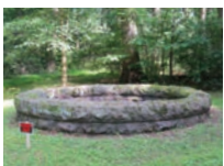
ORIGINAL PARK FOUNTAIN (4)

In 1885, a delegation of the Pennsylvania National Guard (PNG) was invited by Robert Coleman to inspect Mt. Gretna as a possible encampment for its Third Brigade. As a result, General Gobin decided to encamp here beginning in July 1885. This began the clearing of 120 acres originally designated as Camp Sigfried. The camp extended from the west side of Main Ave., approximately one mile along Timber Rd. and Valley Rd. to the current Timber's Restaurant where General Gobin's headquarters were located. The Encampment stretched approximately three miles west to Colebrook. This Camp was the predecessor to the current Ft. Indiantown Gap