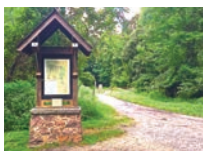
CORNWALL & LEBANON RAILROAD (1)