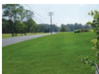
SOLDIERS FIELD (6)

In 1892, a charter was granted to The Pennsylvania Chautauqua which arose from the Chautauqua movement which began in 1874 at Lake Chautauqua, New York. (Cont'd on back.)