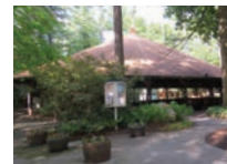
CAMPMEETING TABERNACLE (26)