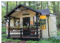
CHAUTAUQUA POST OFFICE (14)