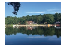
CONEWAGO LAKE (10)