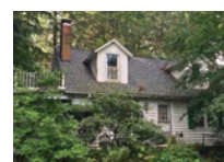
THE HEIGHTS (30)