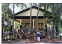
CHAUTAUQUA LITERARY AND SCIENTIFIC CIRCLE BUILDING (13)