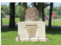
16TH PENNSYLVANIA INFANTRY MONUMENT (7)