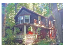
HARVARD AVE. COTTAGES (20)