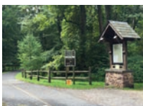
MT. GRETNA PARK ENTRANCE (2)

The Rail Trail Spur you have traveled was the original "Avenue" leading from the Cornwall & Lebanon Railroad (C&LRR) into Mt. Gretna Park. Known as Main Ave., it extends to Rt. 117. The majority of Mt. Gretna Park was located east of Main Ave. By 1891, Mt. Gretna Park featured hot air balloon rides, a carousel, the first roller coaster in PA, a bowling alley, a dancing and skating pavilion, an excursion