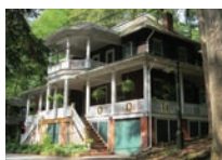
HERMANN COTTAGE (21)