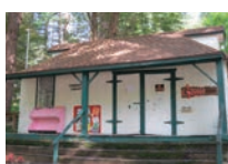
CAMPMEETING FIREHOUSE (24)