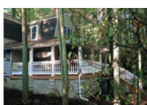
PENNSYLVANIA AVE. COTTAGES (17)