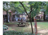
MEMORIAL PARK (27)