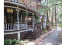
OTTERBEIN AVE. (28)