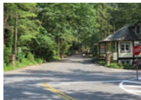
PENNSYLVANIA CHAUTAUQUA ENTRANCE (11)