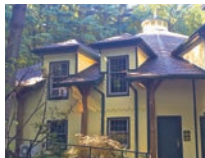
MT. GRETTNA PLAYHOUSE (18)

15 The Jigger Shop 202 Gettysburg Ave. Erected before 1900, in the early days it was known as Meyer's Pavilion. It has been an ice cream parlor since before 1910.