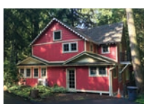
PRINCETON AVE. COTTAGES (22)