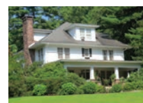
MT. GRETTNA INN AND KAUFFMAN PROPERTY (29)