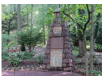
CONEWAGO HILLS MONUMENT (8)