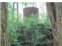
MT. GRETNA NARROW GAUGE RAILROAD (5)

A prior monument was erected on this spot in 1898 to commemorate the PNG's preparation, at this location, for the Spanish-American War, but was torn down when the Conewago Hotel was constructed nearby in 1908. Due to public outcry, the current replacement monument was constructed in 1909. This monument contains the Maine Memorial Tablet, constructed in 1916, made from metal recovered from the Battleship Maine which sunk in Havana Harbor in 1898, killing 266 and precipitating the Spanish-American War.