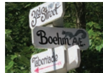
BOEHM AVE. (25)

31 Mt. Gretna Roller Rink First St. & Rt. 117 Part of Mt. Gretna Park, this building was constructed in 1890. It is the oldest remaining building in Mt. Gretna. Originally the Farmers Encampment Building, it was also known as the Lecture and Exhibition Building. Annual picnic gatherings of farmers were held here. Daily crowds of up to 20,000 people attended farming presentations. It later served the Park as a dance hall and movie theater. Remnants of one of the first Mt. Gretna springhouses, constructed in May 1884, are located in the brush to the northeast of this structure.