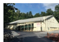
MT. GRETTNA ROLLER RINK (31)

Historic District was added to the National Register of Historic Places in 2012.