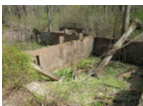
FOUNDATION OF C&LRR STATION (3)

Across Main Avenue from the fountain are remnants of the boarding terminal for the excursion railroad line which skirted the north and west