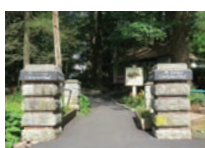
MT. GRETTNA CAMPMEETING ENTRANCE (23)