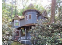
JOHN CILLEY COTTAGE (19)