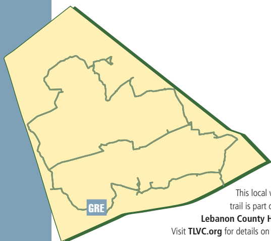
This local walking/driving trail is part of the 100-mile Lebanon County Heritage Trail. Visit TLVC.org for details on the entire trail.

The Mt. Gretna Tour begins at the original entrance to Mt. Gretna Park. Parking is available along Timber Road. Walk up the Mount Gretna Spur to find the kiosk at Site No. 1.