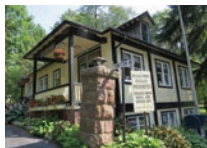
MT. GRETTNA POST OFFICE (12)