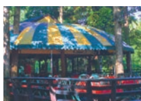
THE JIGGER SHOP (15)