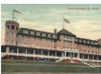
CONEWAGO HOTEL SITE (9)